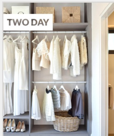
TWO-DAY STRESS RELIEVER