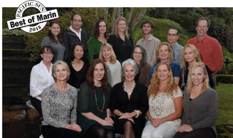
The 2015 Changing-Places Team